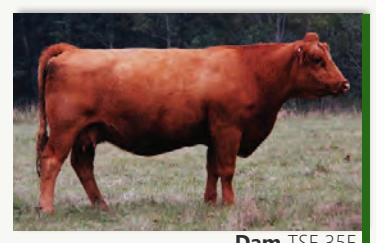
Dam TSF 35F