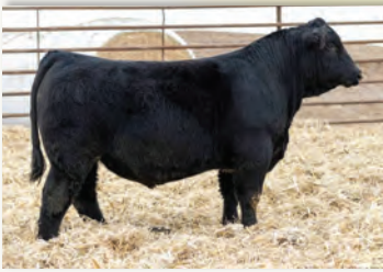
Sire LCDR FAVOR 149F