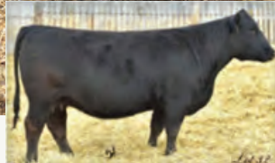
Dam BSCC 18X