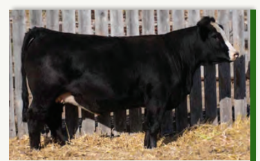
Dam NUG 20H