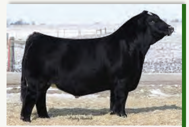
Sire DEW NORTH 102C