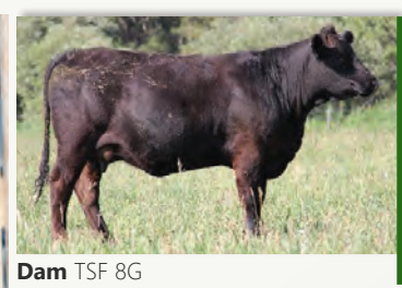
Dam TSF 8G