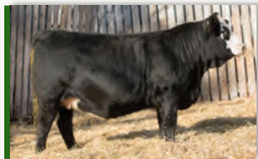
Dam RCF 695H