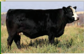
Dam CMS 122J