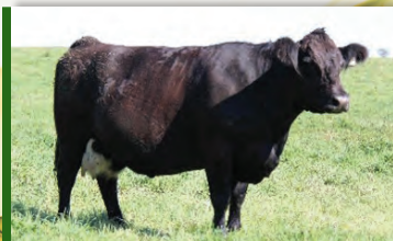
Dam TSF 14B